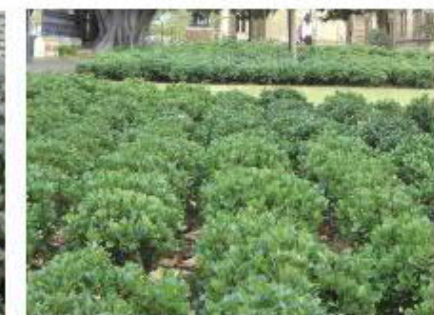
RAPHIOLEPIS 'ORIENTAL PEARL'