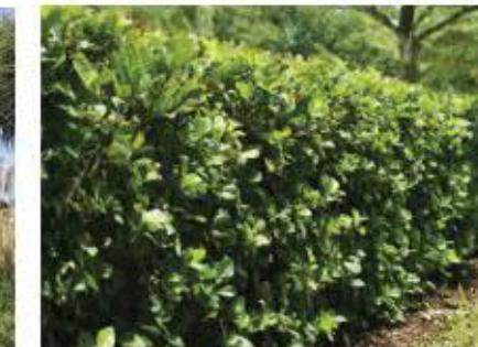
VIBURNUM 'EMERALD LUSTRE'