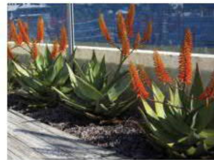
ALOE 'OUTBACK ORANGE'