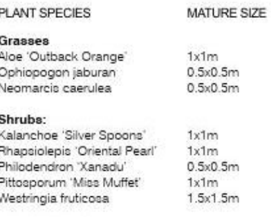
PITTOSPORUM 'MISS MUFFET'