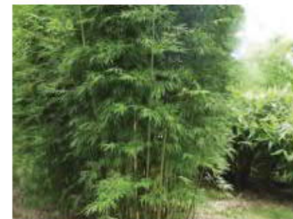
BAMBUSA TEXTILIS 'GRACILIS'