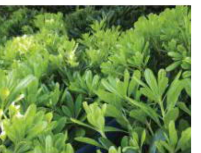
PITTOSPORUM 'MISS MUFFET'