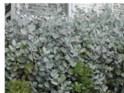
KALANCHOE 'SILVER SPOON'